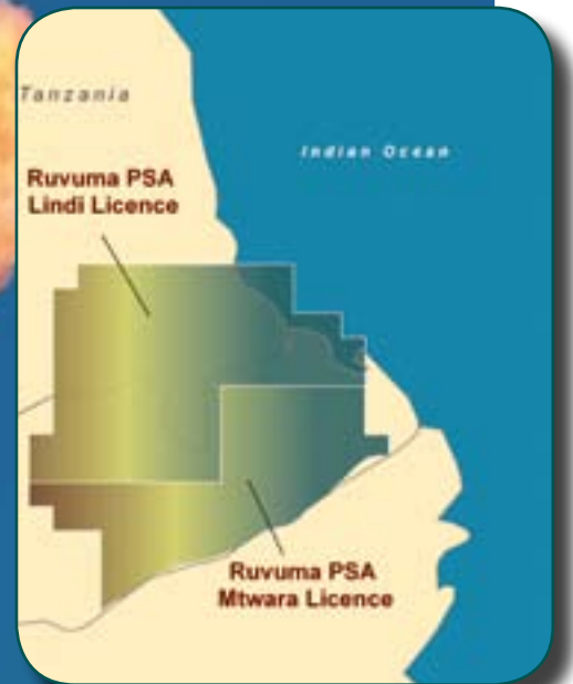
Ruvuma PSA, Tanzania