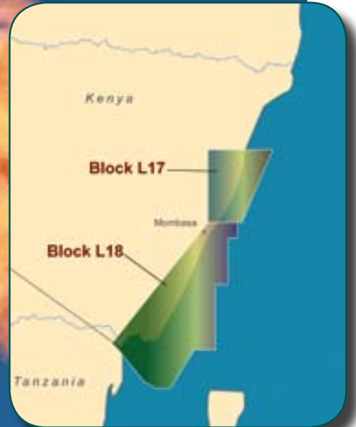
Kenya – L17/18 PSC