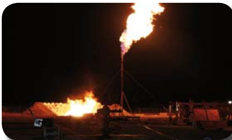
Testing gas at Kiliwani North-1 well, Tanzania

In the USA we drilled a step-out well in the South Weslaco Field, Hidalgo County, Texas early in the year which is now delivering gas to market, and subsequently we drilled Sunny Ernst-2, a deep exploration well, at Alta Loma, Galveston County, Texas in the third quarter. Sunny Ernst-2 was the most successful well we have ever drilled in the USA, testing gas at 6 million