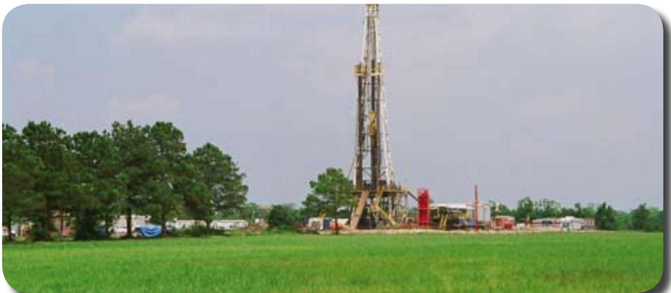
Drilling the Sunny Ernst-2 well at Alta Loma, Texas