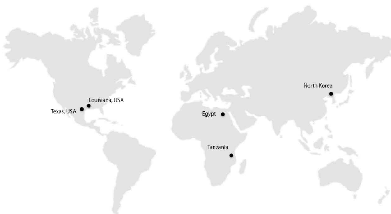
Exhibit 1 - Aminex's global footprint