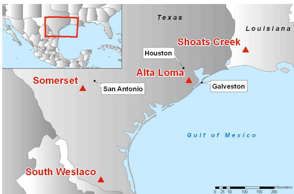
Exhibit 2: USA licences in Texas and Louisiana

Over the last 15 years the company has participated in over 50 wells in the region.